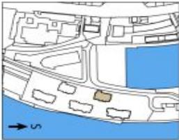
poloha domu / location of the house