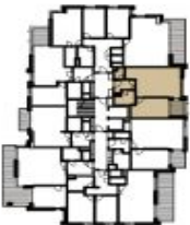
schéma podlaží schematic floor plan

Upozornění: Plochy jednotlivých místností jsou pouze orientační. Vybírané zařízení v plánech bytů (nábytek, kuch. linka, el. spotřebiče atd.) není součástí dodávky. Rozsah dodávky je specifikován ve standardu. Note: This drawing is for illustration only. The set up of interior (furniture, kitchen, el. appliance, etc.) featured in the apartment drawings is not subject of delivery. The scope of delivery is specified in the standard. (2.1.10.2015)