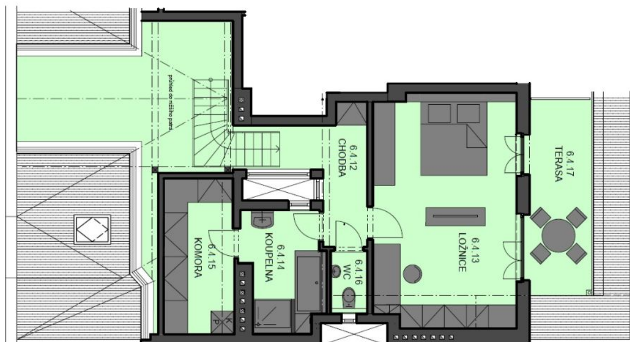
PŮDORYS 7. NP