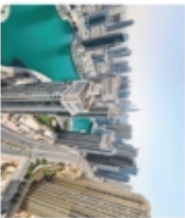
Sample view from the apartment