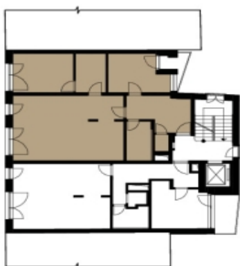
Pozice v rámci podlaží 2.NP