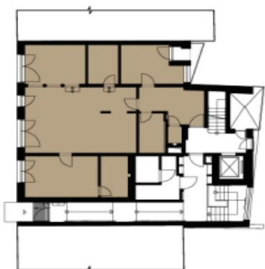
Pozice v rámci podlaží 1.NP