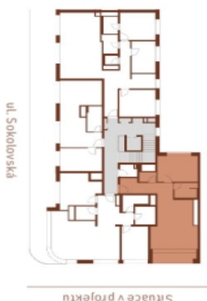
Situace v projektu