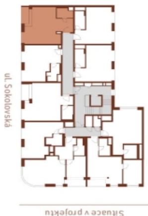
Situace v projektu

svoboda&williams | CHRISTIE'S EXKLUZIVNÍ ZASTOUPENÍ EXCLUSIVE REPRESENTATION INTERNATIONAL REAL ESTATE