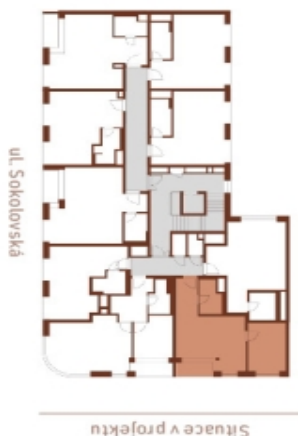
Situace v projektu