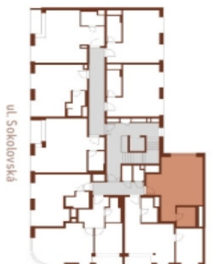
Situace v projektu