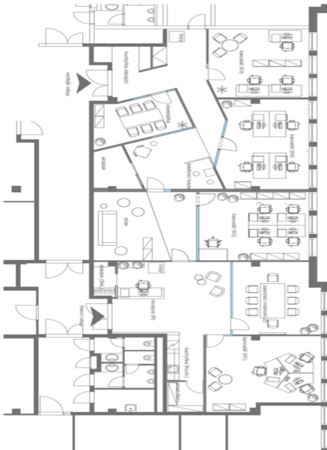
6. patro / 6th floor