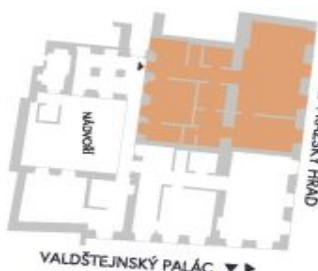
UMÍSTĚNÍ V RÁMCI PODLAŽÍ