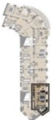
VÝMĚRA BYTU / FLAT AREA