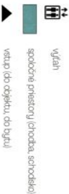
Schéma pôdorysu domu predstavuje dispozíciu resp. možné riešenie bytu. Developer si vyhradzuje právo na zmenu a upresnenie bez predchádzajúceho upozornenia.