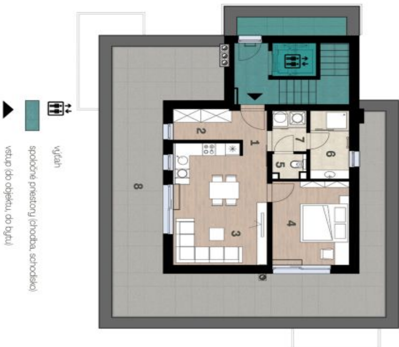
Schéma pôdorygu domu predstavuje dispozíciu resp. výstavbu bytu. Developer si vyhradzuje právo na zmenu a upresnenie bez predchádzajúceho upozornenia.