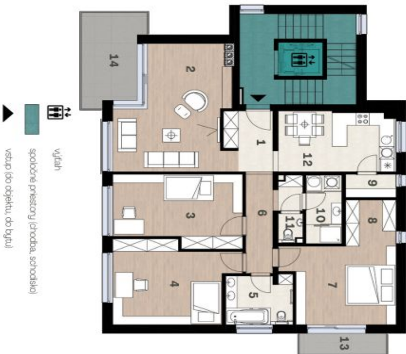
Schéma pôdorysu domu predstavuje dispozíciu resp. výstavbu bytu. Developer si vyhradzuje právo na zmenu a upresnenie bez predchádzajúceho upozornenia.