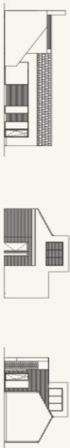
Schéma půdorysu domu představuje dispozici řešené domu. Kuchynská linka a nábytek nejsou součástí dodávky domu, zřízení je zahrnuto pouze pro názornost. Specifikace pro konstrukce, povrchové úpravy a rozsochí vybavení je přiložen přílohy. Standard nemovitosti - Developer si vyhrazuje právo na změny a upřesnění bez předchozího upozornění!