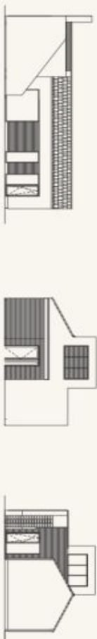
Schéma předstírá domů představuje dispozici řešení domu. Kuchynská linka a nábytek nejsou součástí dodávky domu, zařízení je zobrazeno pouze pro názornost. Specifikace pro konstrukce, povrchové úpravy a rozložení vybavení je předmětem přílohy "Standard nemovitosti". Developer si vyhrazuje právo na změny a upřesnění bez předchozího upozornění.