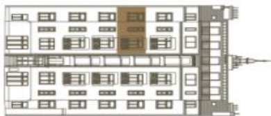
Schéma půdorysu bytu představuje dispoziční řešení bytu. Kuchyňská linka a nábytek nejsou součástí dodávky bytu, zařízení je zobrazeno pouze pro názornost. Plocha zahrady je orientační. Specifikace pro konstrukce, povrchové úpravy a rozsah vybavení je předmětem přílohy "Standard nemovitosti".

svoboda&williams | CHRISTIE'S INTERNATIONAL REAL ESTATE