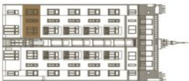
Schéma půdorysu bytu představuje dispoziční řešení bytu. Kuchyňská linka a nábytek nejsou součástí dodávky bytu, zařízení je zobrazeno pouze pro názornost. Plocha zahrady je orientační. Specifikace pro konstrukce, povrchové úpravy a rozsah vybavení je přednětem přílohy "Standard nemovitosti".

svoboda&williams | CHRISTIE'S INTERNATIONAL REAL ESTATE