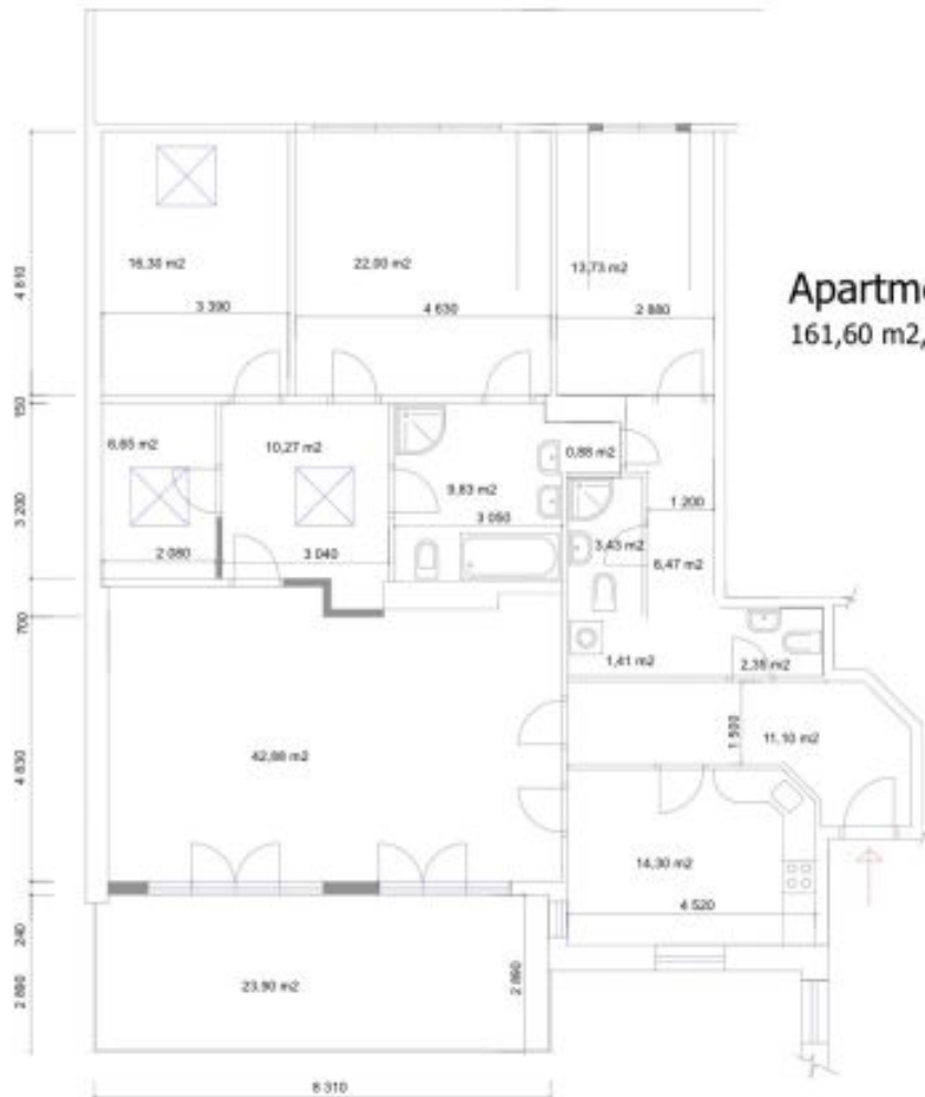
Apartment II, 6th Floor 161,60 m 2 , Balcony + terrace 23,9 m 2