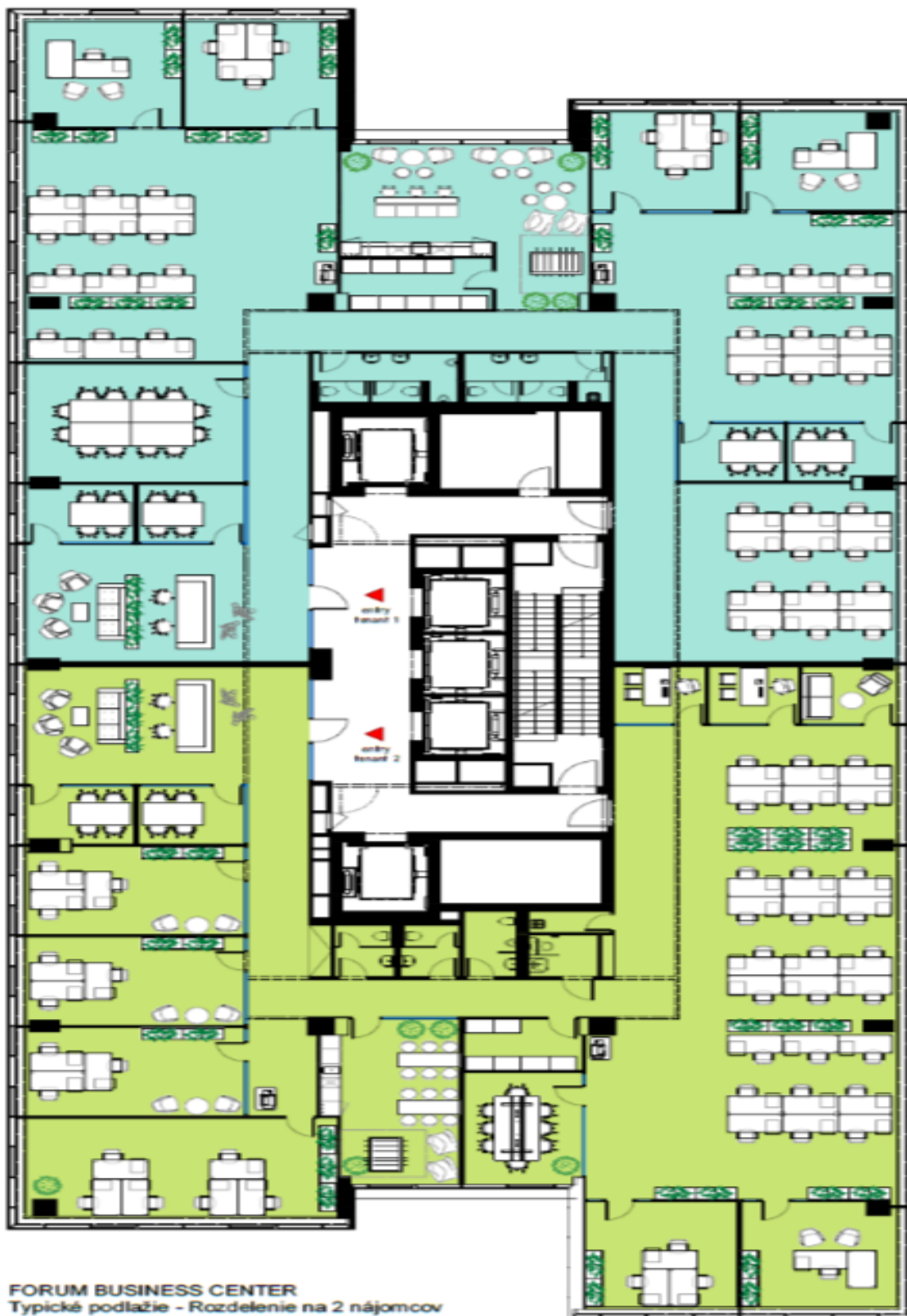
FORUM BUSINESS CENTER Typické podlažie - Rozdelenie na 2 nájomcov