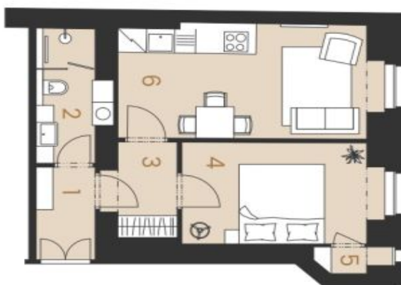
Schéma podlahy bytu představuje dispozici včetně bytu. Každý název linky a rodu jelek nejsou součástí dodávky bytu, zřízení je zobrazeno pouze pro názornost. Speciálce pro konstruktora, povrchové úpravy a rozsvět vyložené je představení přílohy "Standard nemovitosti".