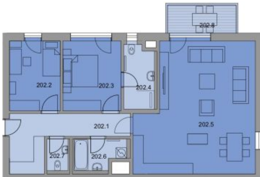
UMÍSTĚNÍ V RAMCI AREÁLU: