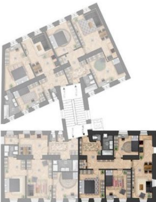
umístění bytu na patře