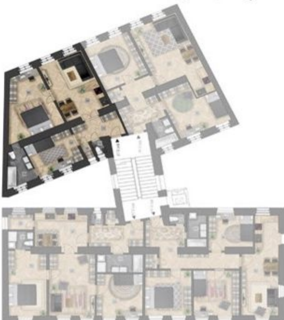
umístění bytu na patře