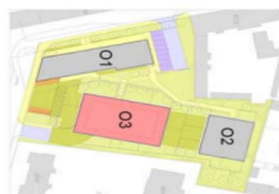
Situace / map