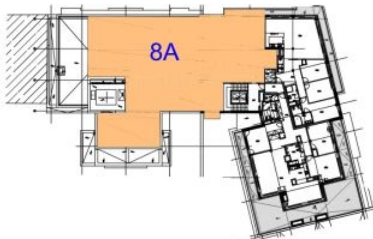
BYT 8A - PŮDORYS (M1:200)