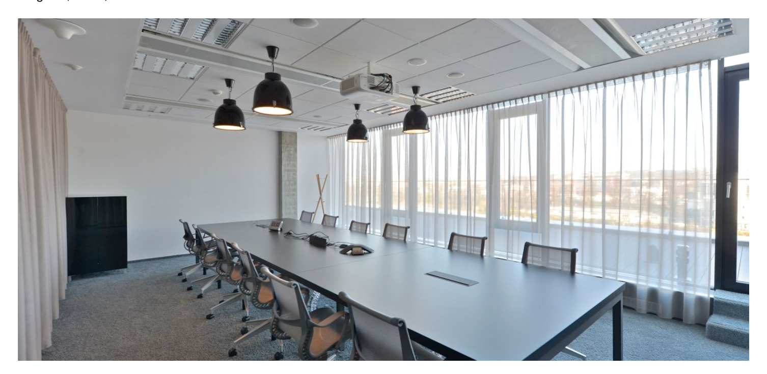
Prague 8, Karlín, Rohanské nábřeží

€ 17.95 - 18.95 / m2 | CZK 449 - 474 / m2