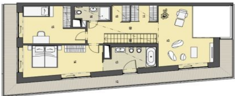
2. PATRO HORNÍ PODLAŽÍ