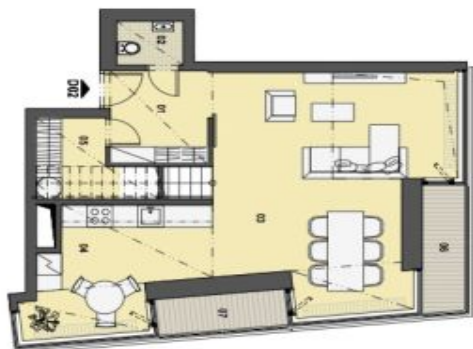
1. PATRO VSTUPNÍ PODLAŽÍ

Srdce každé vlny místnosti 2,6m, resp. 2,8m v šířce. Nábytek a podlahy jsou orientací a designem v přírodních tónech. Málokdy k vidění linie vnitřní architektury současně dodávají bytu, který vybavení je zobrazeno pouze pro ilustraci.