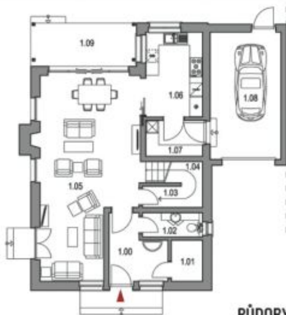
PŮDORYS 1.NP / GROUND FLOOR