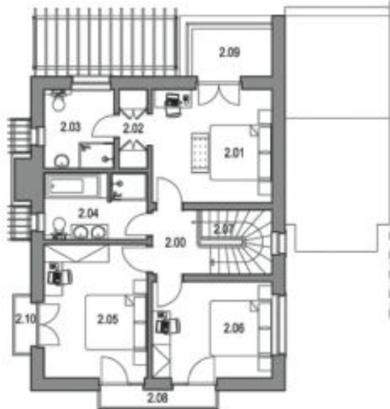
PŮDORYS 2.NP / FIRST FLOOR