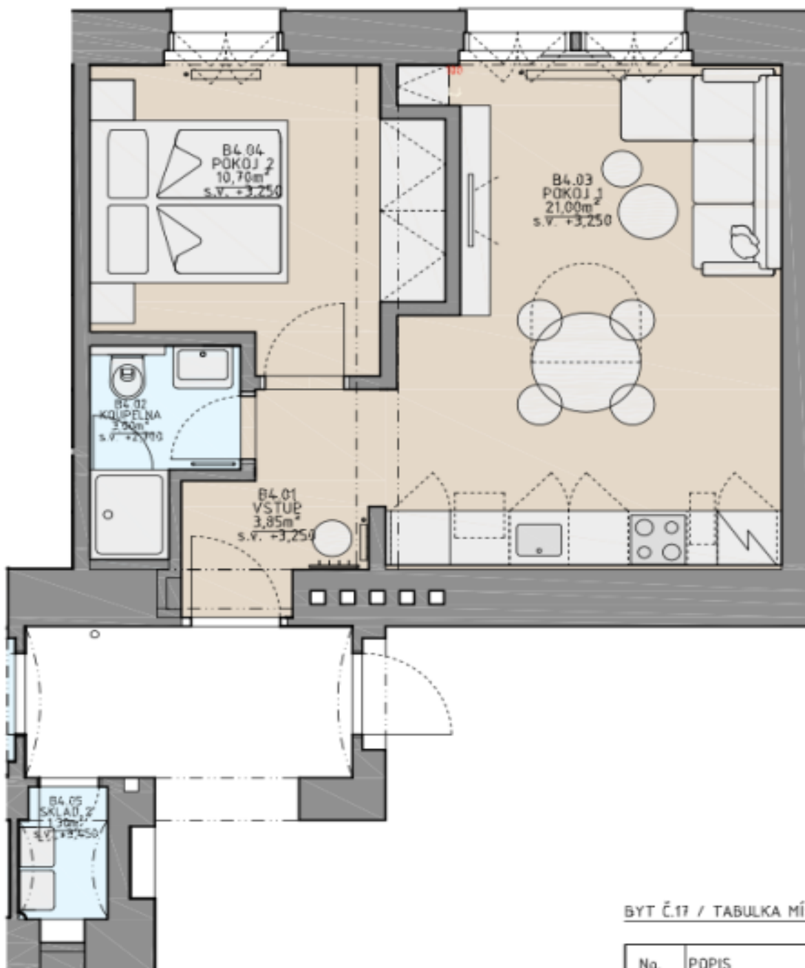
BYT Č.17 / TABULKA MÍSTNOSTÍ

39.85 m 2 , Prague 3, Žižkov, Kubelíkova