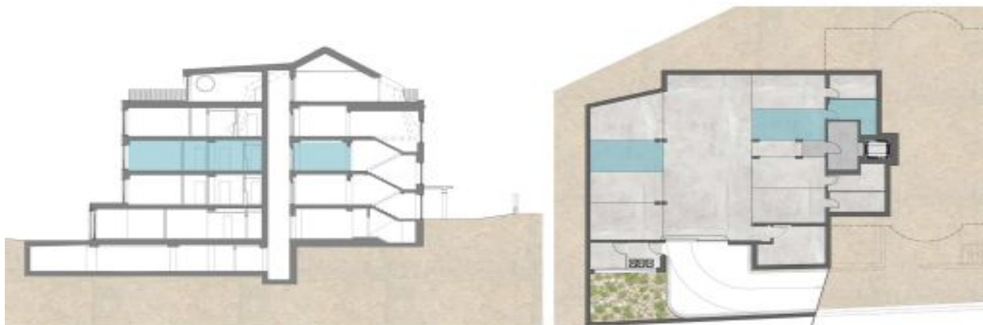
Location within the residence