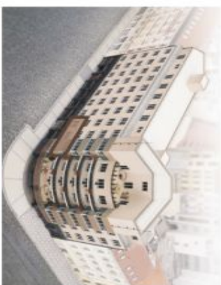
PODLAŽÍ / FLOOR

www.londonhouse.cz , info@londonhouse.cz