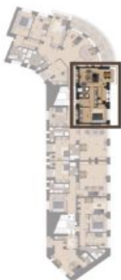
VÝMĚRA BYTU / FLAT AREA